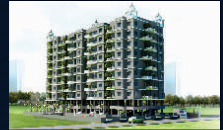
AXISA 1 & 2 BHK SMART HOMES @ KIWALE-RAVET