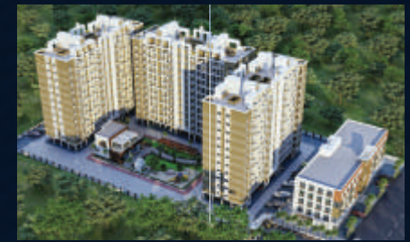
SUVARN NAGARI 1 & 2 BHK HOMES @ ALANDI MARKAL ROAD